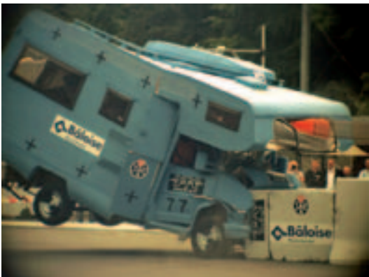
Car crash (off board)